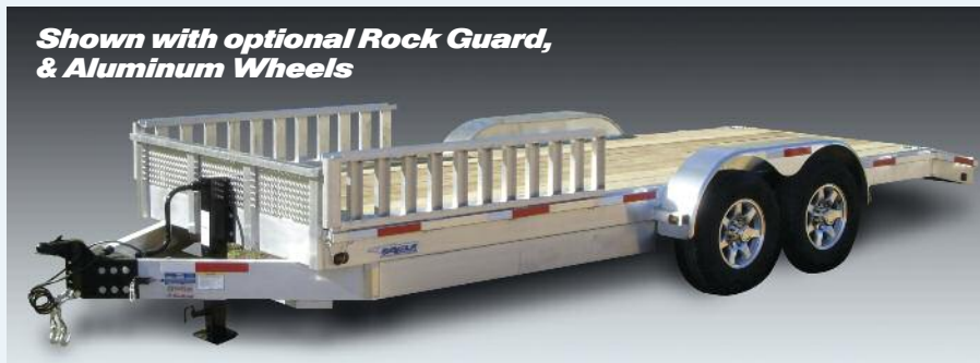
Shown with optional Rock Guard, & Aluminum Wheels