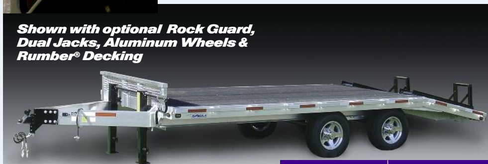
Shown with optional Rock Guard, Dual Jacks, Aluminum Wheels & Rubber® Decking