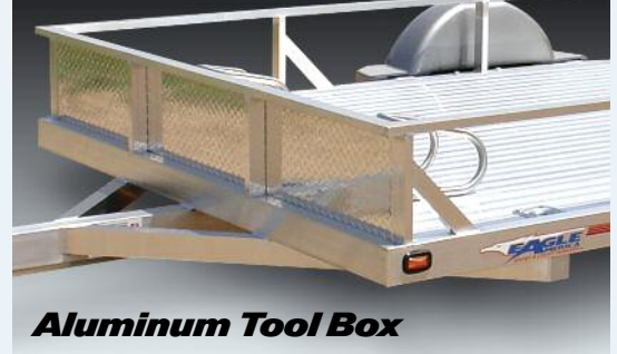
Aluminum Tool Box