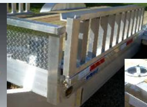
Heavy Duty Ramps 2 Ft. Dove Tail